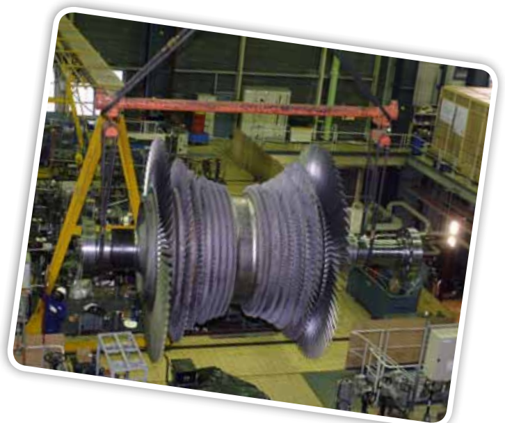
Laborelec assists in the selection of the most appropriate non-destructive testing technique to ensure a quick and efficient intervention on your steam turbine.

When a relevant indication is detected, our experts can perform the analyses required to identify the root cause of the problem and calculate the component's remaining lifetime.